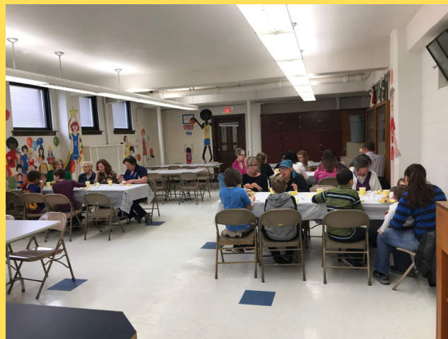
Mother's Day Brunch